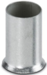
Ferrule, length: 12 mm, color: silver

Please be informed that the data shown in this PDF Document is generated from our Online Catalog. Please find the complete data in the user's documentation. Our General Terms of Use for Downloads are valid ( http://phoenixcontact.com/download )